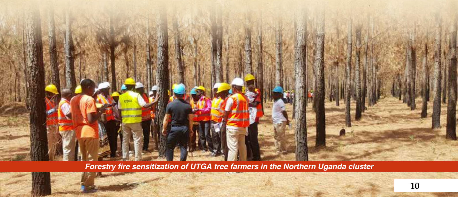
Forestry fire sensitization of UTGA tree farmers in the Northern Uganda cluster

There were isolated cases of tree deaths at a few