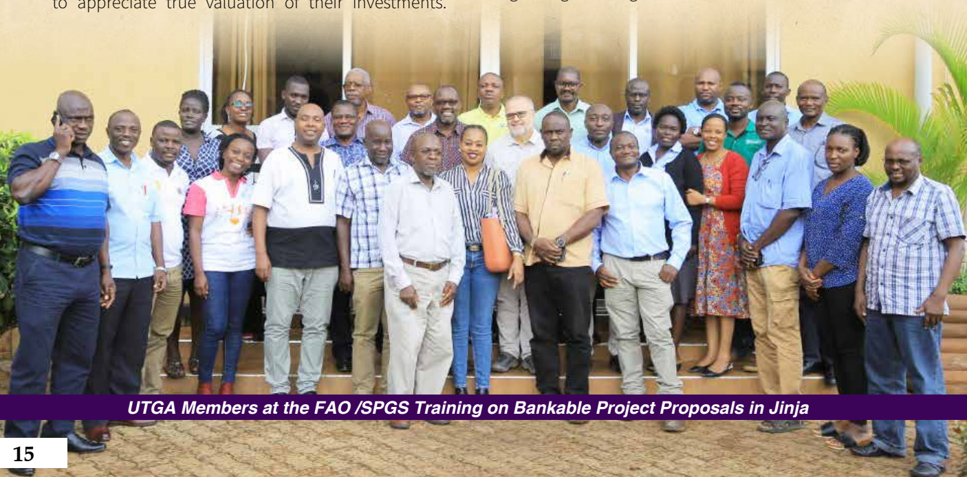
UTGA Members at the FAO /SPGS Training on Bankable Project Proposals in Jinja