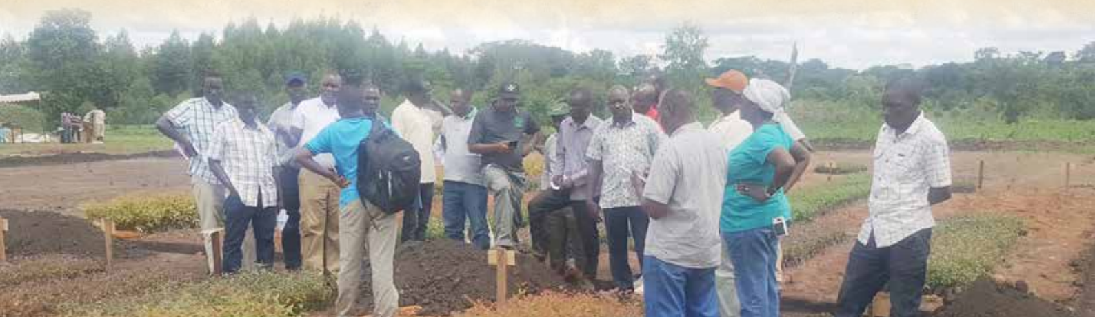
Growers at a UTGA field meeting in the Albertine cluster

One of the benefits of UTGA members is to receive member discounts on improved seed and seedlings, tools &