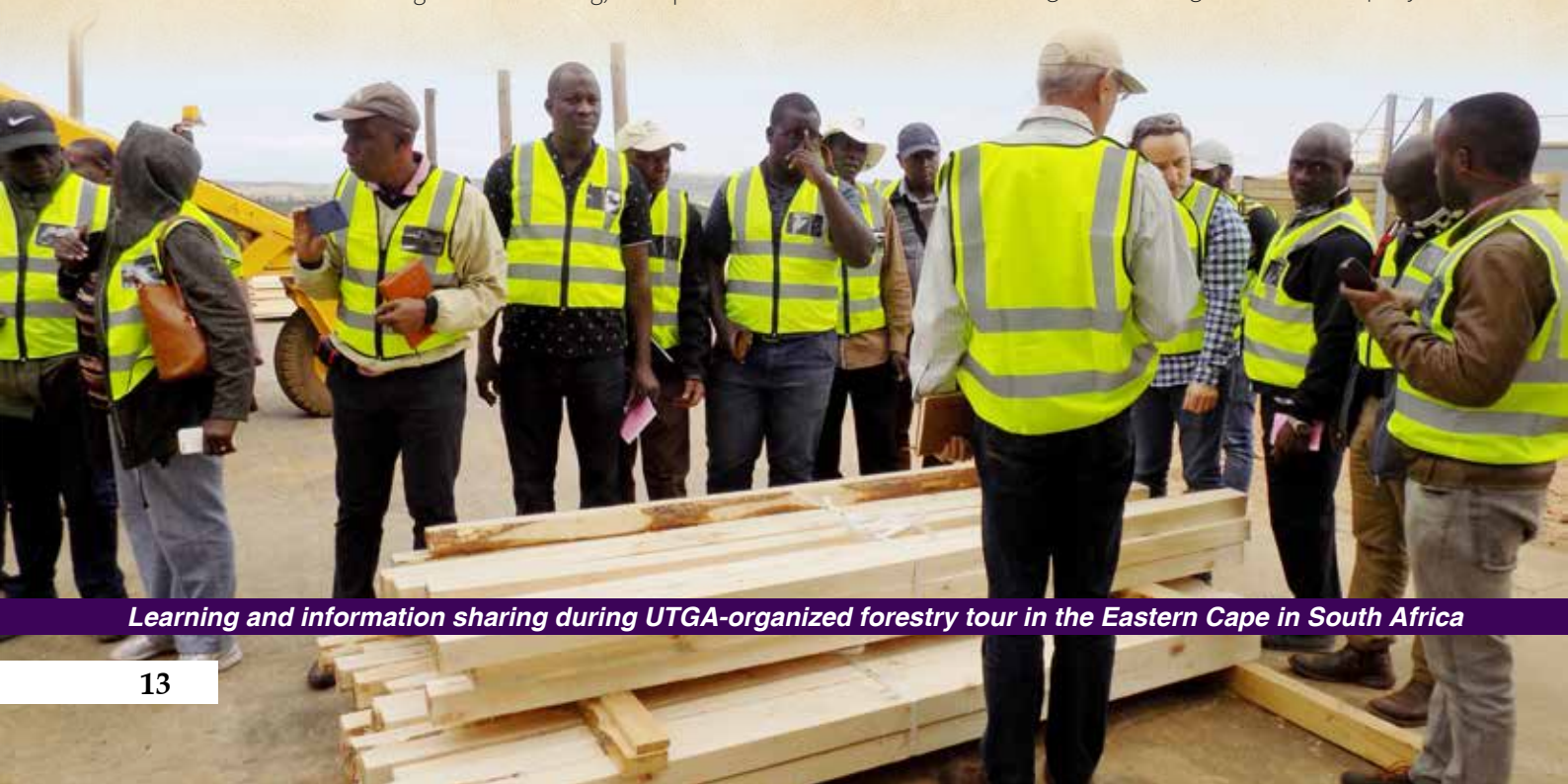
Learning and information sharing during UTGA-organized forestry tour in the Eastern Cape in South Africa

Downstream Processing.” The team visited Humansdorp Dairy to get knowledge on Biomass supply arrangements and logistics, Woodland sawmills to see large scale wood sawing and alignment of technology to log sizes, Kubusi plantations & sawmills – Rance Timbers in Stutterheim to understand thinning processes, clear fell harvesting & integrated sawlog processing. The growers visited Chip Board Mill to understand planning and understanding scale of operations, processes and products, Mabandla Community- Forestry Community arrangements – Plantations and sawmill, Weatherboard Sawmill for industrial saw log processing and pallet manufacture, Pallet link - Industrial saw log processing and pallet manufacture, UCL Cooperative in Darlton for institutional arrangements of growers to process their timber and sugar cane and NCT Forestry Cooperative in Pietermaritzburg on institutional arrangements of growers & company