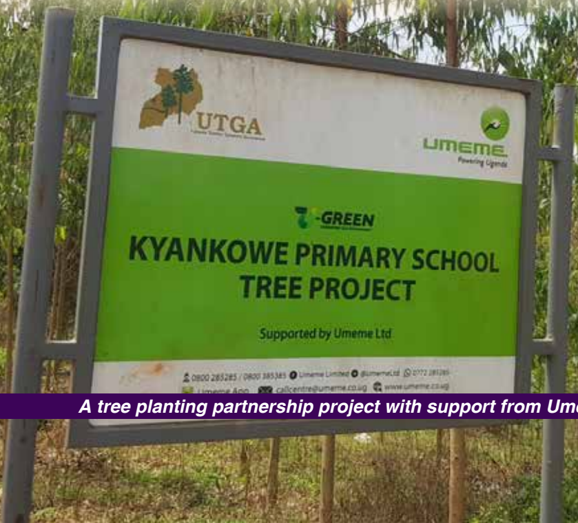
A tree planting partnership project with support from Umeme Ltd.